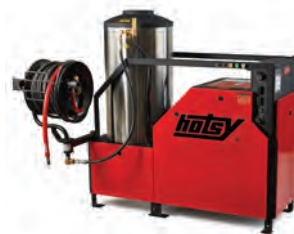
Black Label version comes with hose & hose reel

Upright, vertical coil with 1/2-inch schedule 80 pipe is wrapped with a thick ceramic fiber insulation, delivering high efficiency and maintains constant temperature using Natural Gas or LP Gas